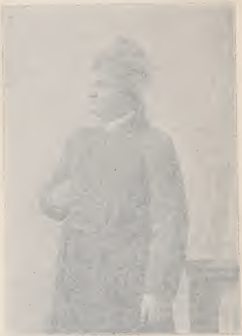
ST. MARY VICTORIA